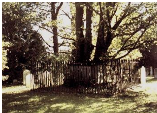
A tree with four roots grows from site of Lady Grimston's tomb in St. Peter's Churchyard, England

But over the years the marble cracked and a tree began to grow, and grow and grow! It tilted the stone and broke the marble masonry, tearing the iron railing out of the ground. Today's many visitors are amazed by the massive trunks of one of the largest trees in England actually growing four trunks from a massive root right out of her casket!